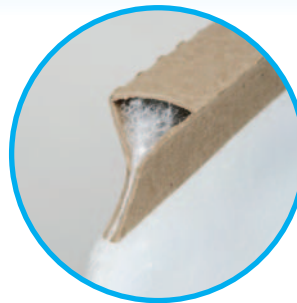
Pinch Frame Design