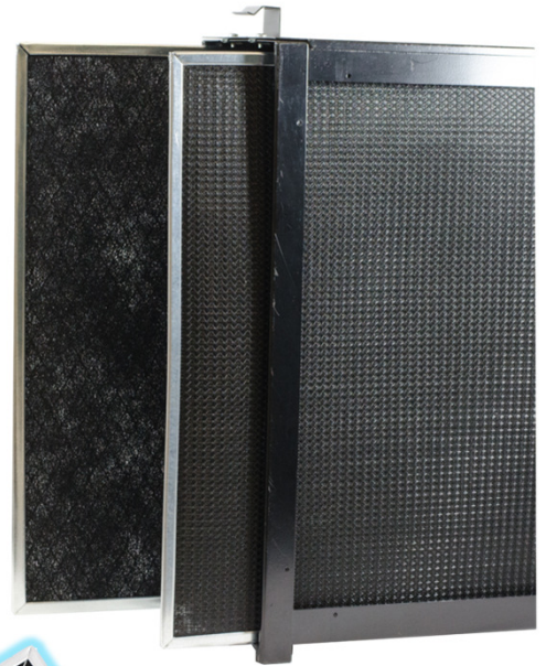
MODEL # EAC-KIT MODEL # EAC-AC4

Activated carbon afterfilters are disposable as it reaches the saturation point and available in 4-packs replacements.